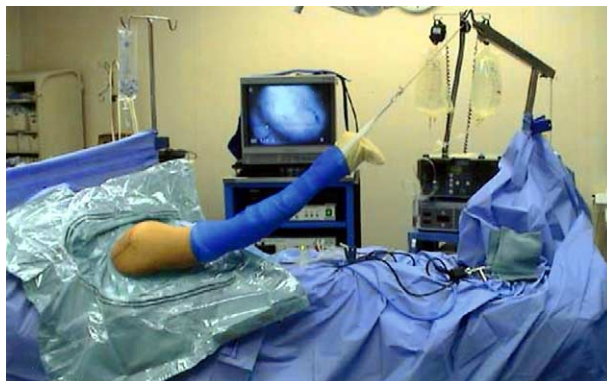
FIGURE 3. Ten pounds of skin traction is applied. The foot of the bed can be lowered slightly to increase distance to the traction apparatus.

Three procedures were converted to an open repair with excellent visualization and access to the surgical site.