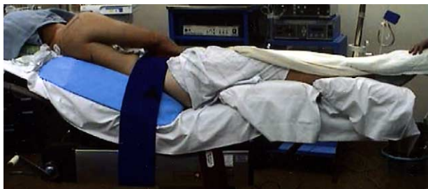
FIGURE 2. The patient is secured with large Velcro straps around the patient, pillow, and table. The table is flexed slightly at the hips and the back of the table is elevated approximately 30°.

We have reviewed the last 50 procedures performed in this position. The procedures were performed on the right side in 27 patients and on the left in 23 patients. A wide spectrum of problems was noted in this patient population, including subacromial impingement, rotator cuff tears, subscapularis muscle tears, instability, glenoid labrum tears, calcific tendonitis, periprosthetic adhesions, biceps tendonitis, and acromioclavicular joint arthritis. Fifty-five procedures were performed in 50 patients. The procedures included 16 subacromial decompressions/debridements, 5 acromioclavicular joint resections, 21 rotator cuff repairs, 2 slap repairs, 5 anterior instability repairs, 2 subscapularis repairs, 3 capsular releases and debridements, and a single arthroscopy of a hemiarthroplasty.