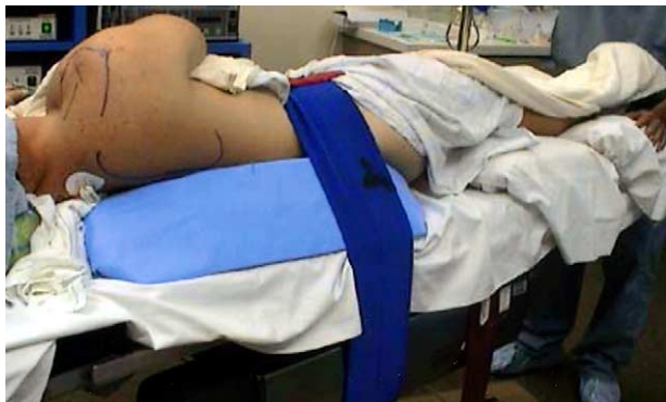
FIGURE 1. Under general anesthesia, the patient is rolled 45° to the nonoperative side with a customized foam pillow. The pillow is designed and positioned to align with the medial border of the scapula.

usually necessary. A foam pillow is used to position the head in neutral position with respect to the body. No axillary pillow is used for the position.